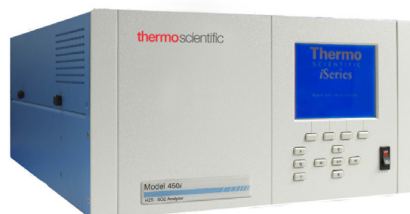
Thermo Scientific™ Model 450 i Hydrogen Sulfide and Sulfur Dioxide Analyzer

You can easily program shortcut keys to allow you to jump directly to frequently accessed functions, menus or screens. The larger interface screen can display up to five lines of measurement information while primary screen remains visible.